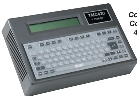
Compact TMC420 Controller features 4-line LCD Display — no PC required.